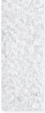
Galvalume TSR 25%